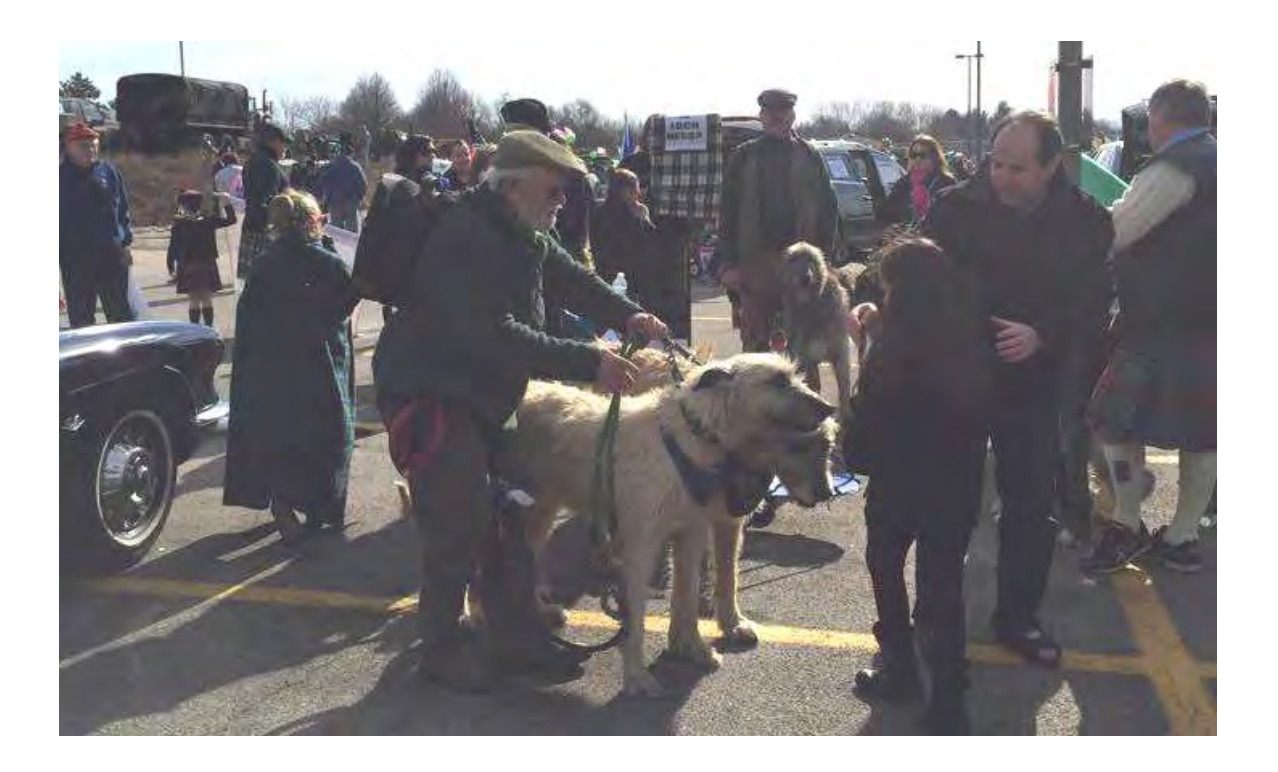
South Side St Patricks Parade