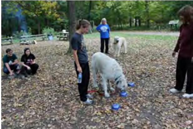
FIND THE HOT DOG

We ask is that you bring a small side dish or dessert