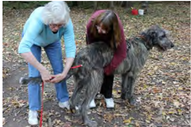
MEASURING FOR LONGEST TAIL

There will be games and prizes. A contest for the longest tail and tallest dog and of course the wolfhound costume contest.