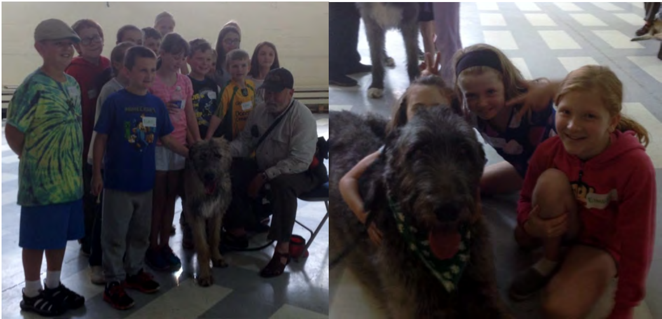
With the Children of the Irish School of Music