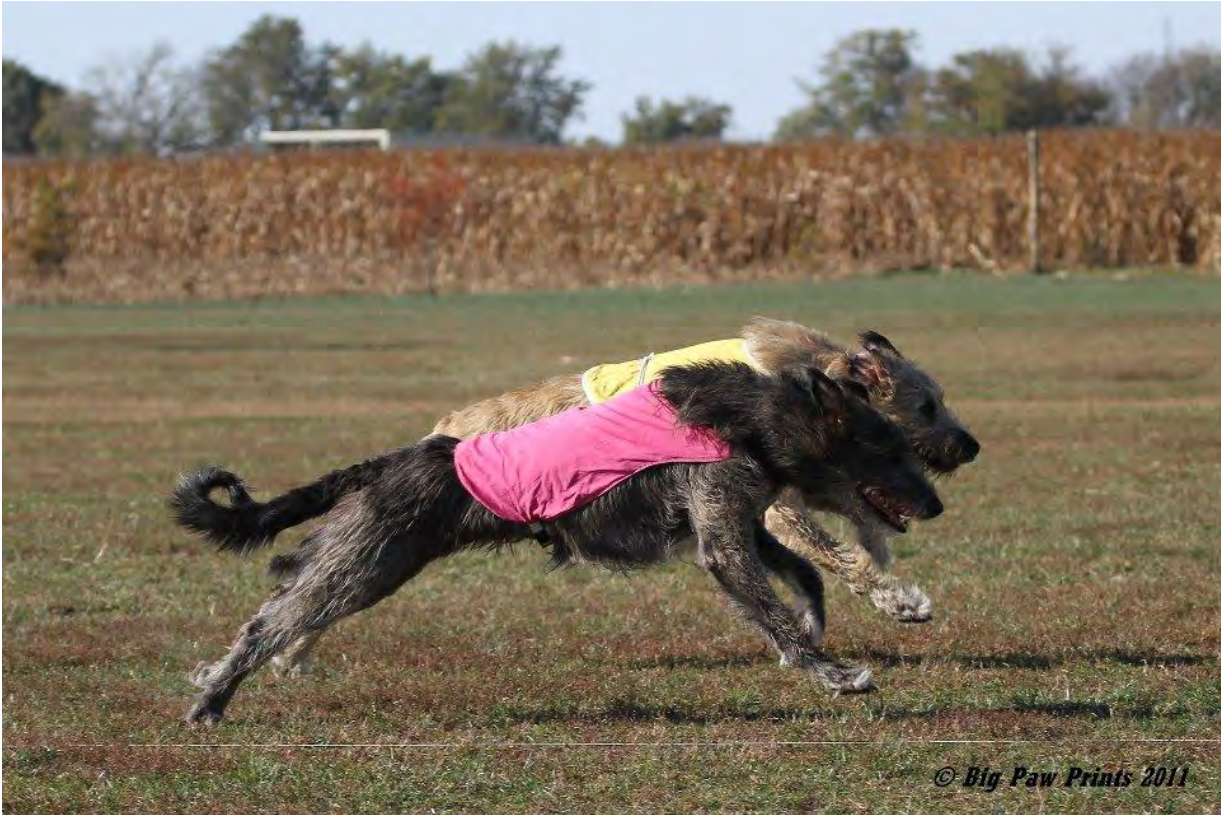
Odie and Noor