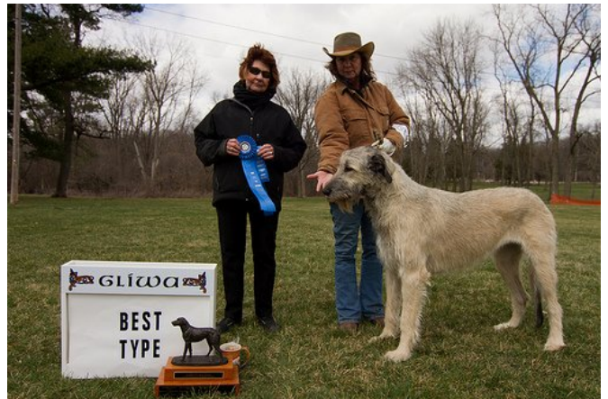
BEST TYPE –