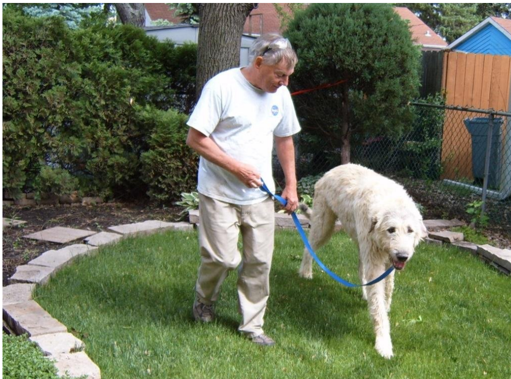
Decatur St Patrick's Parade