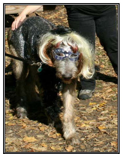
Tosca was dressed up as the amazing Lady GaGa (Katie Wunsch)

The Best Costume contest was next, we had eight dogs entered and they were all dressed to the hilt. After parading around for all of us to see, everyone agreed that all eight had the best costume and won!