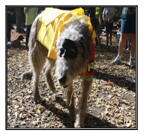
Roric was very cool as Wonder Boy (Leslye Sandburg)