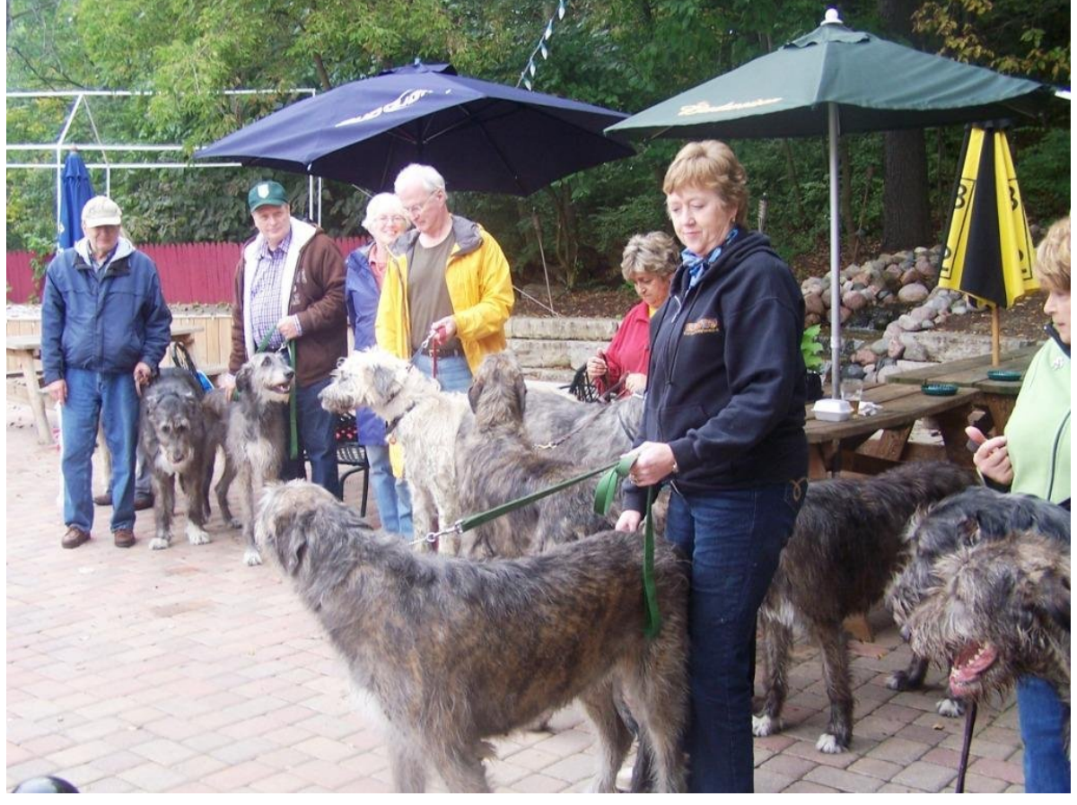
GENTLE WHEN STROKED ~ FIERCE WHEN PROVOKED