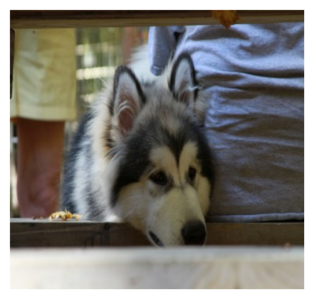
More photos can be seen on our Facebook page GENTLE WHEN STROKED ~ FIERCE WHEN PROVOKED